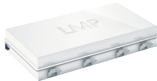
LMP battery for the Blue Car (Bolloré)

Different design variants can be found according to the application: